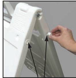
Sand Fill Holes

Each sign frame has four fill holes, two on each side of the frame.